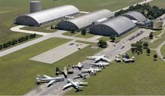
National Air Force Museum-Dayton, OH